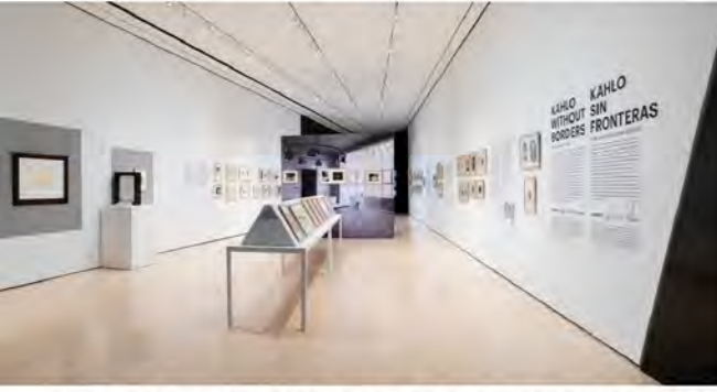
Kahlo Without Borders installation view at the Eli and Edythe Broad Art Museum at Michigan State University, 2022.