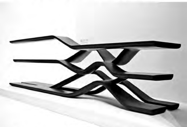
Zaha Hadid, Tela shelving, 2014.

Celebrating Zaha Hadid's Designs celebrates the tenth anniversary of the MSU Broad Art Museum's building, created by the late architect Zaha Hadid. This design-focused retrospective explores Hadid's pioneering vision, from idea to implementation, through a robust survey of design objects (tables, chairs, bookshelves, pendant lamps) as well as sketches, paintings, video animations, and product concepts. The ideas, exploration of materials, and compositional schemes present in her design objects will stand in dialogue with the museum's own architectural design.